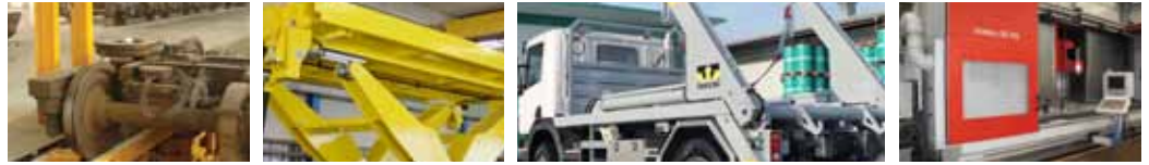
Railway technology Plant technology Vehicle technology Manufacturing Service

Nencki Ltd. offers a comprehensive customer and spare parts service in Switzerland but also through international representatives.